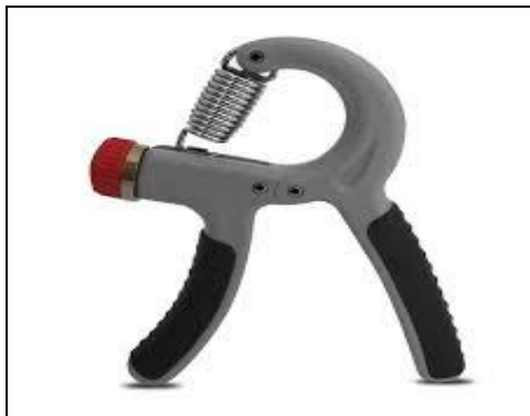
Fig 1: GD grip