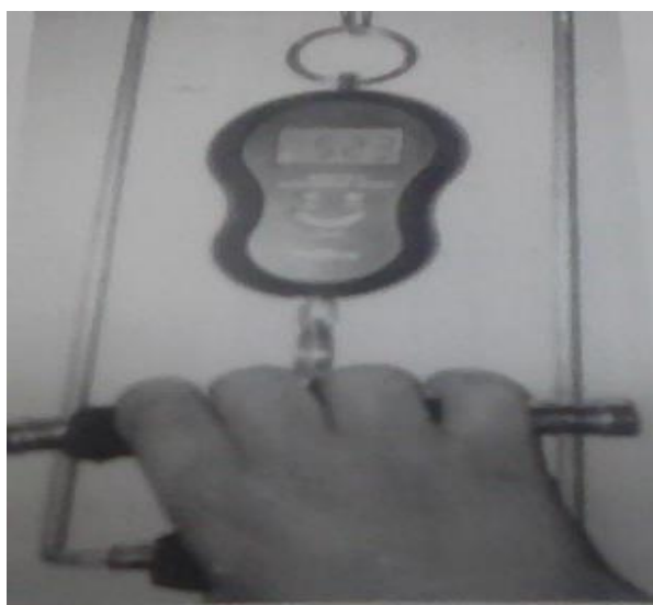
grip strength test GST-2013