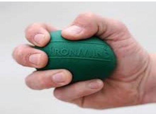
Fig 2: Soft ball