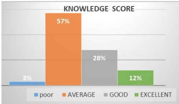
Fig 1: Pie diagram of knowledge scores in frequency and percentage obtain from mother.

Analysis of data related to knowledge level of mothers regarding waterborne diseases of children below five years of age.